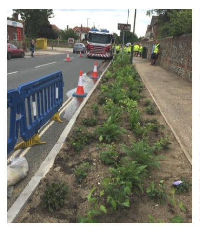
One of the two Littlehampton rain gardens on Maltravers Road.

The Horsham cub scouts have been keeping an eye on the new garden, photographing the emerging wild flower shoots and litter picking. We are really pleased they are so keen to help look after it.