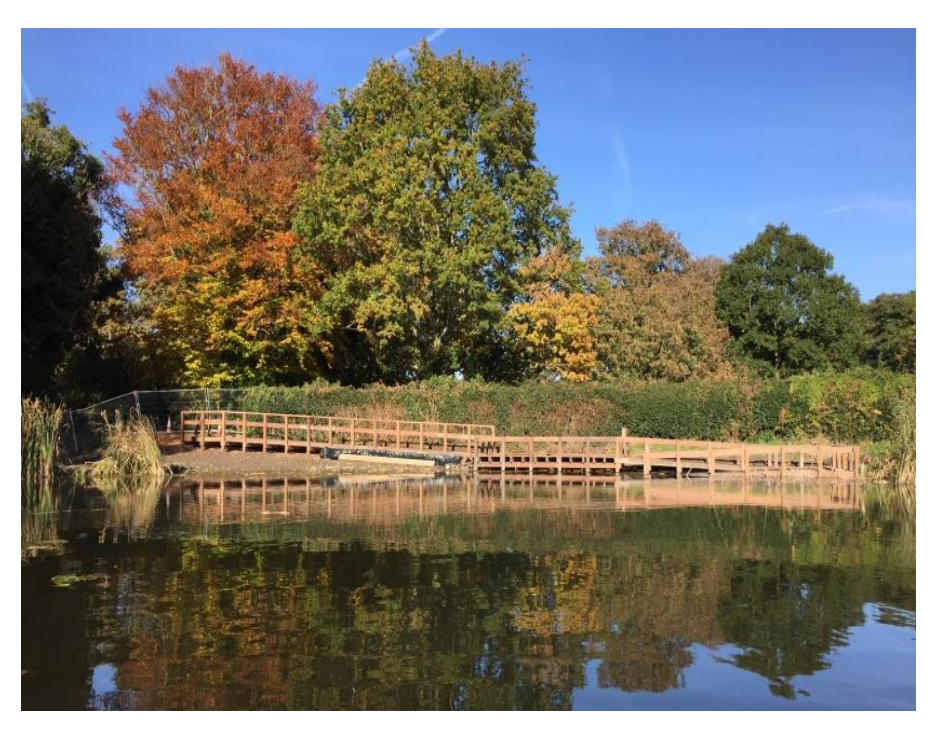
New wheelchair accessible platform at Burton Mill Pond

This will allow users the opportunity to enjoy the wonderful views across the pond and watch the abundant local wildlife. It will also provide disabled anglers the opportunity to fish on the pond from a specially designed boat provided by the Wheelyboat Trust, via a ramp into the boat. There is now also a marked disabled bay in the car park opposite the platform for visitors to use.