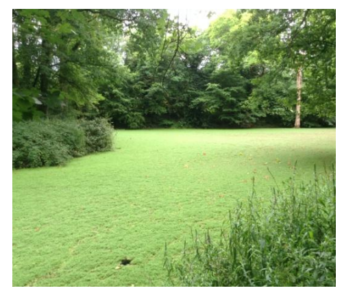
Before weevil release

Stenopelmus rufinasus, commonly known as the azolla weevil, exclusively feeds off the plant without harming any native species and has proven to be an