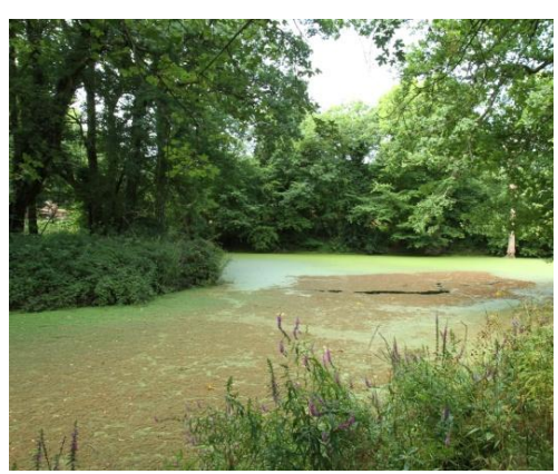
After weevil release

12,000 weevils, supplied by <u>CABI</u> (Centre for Agriculture and Biosciences International),